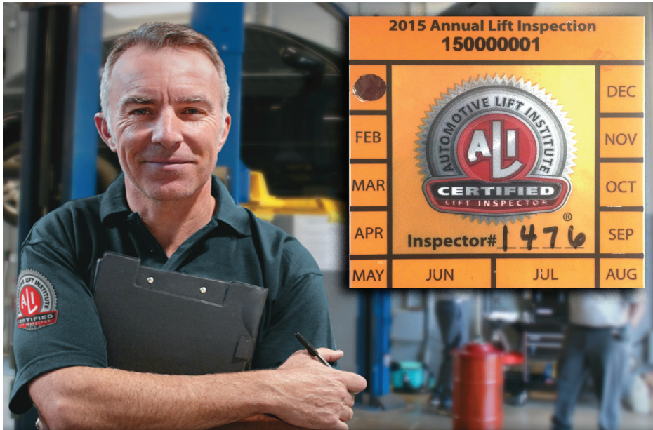
A serialized label is applied to each lift that passes a comprehensive inspection conducted by an ALI Certified Lift Inspector. The label makes it easy for Fixed Ops Managers and health and safety officials to see at a glance if the lift's inspection is up-to-date.