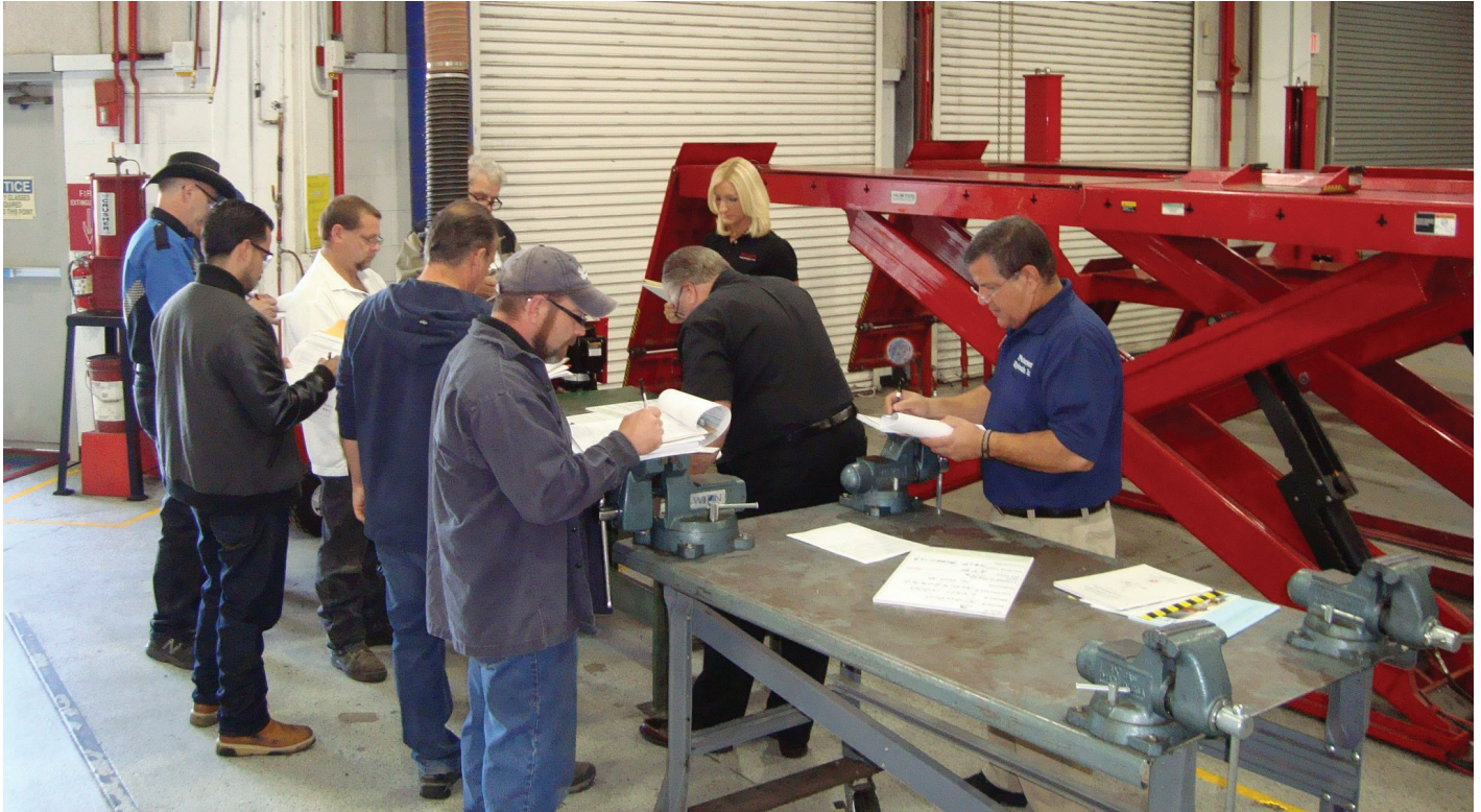
All ALI Certified Lift Inspectors have been tested and proven qualified to inspect any model, type or brand of vehicle lift using an industry-created lift inspection process.

When you hire an ALI Certified Lift Inspector to evaluate Service bay safety in your shop using ALI's requirements, the experience may differ from inspections you have received in the past. The process may take longer, since it's likely more comprehensive. It may even be priced differently. As the industry continues to transition, some lift inspection companies may begin to offer multiple tiers of lift inspection services. These inspections may vary in terms of what they actually address and how much they cost.