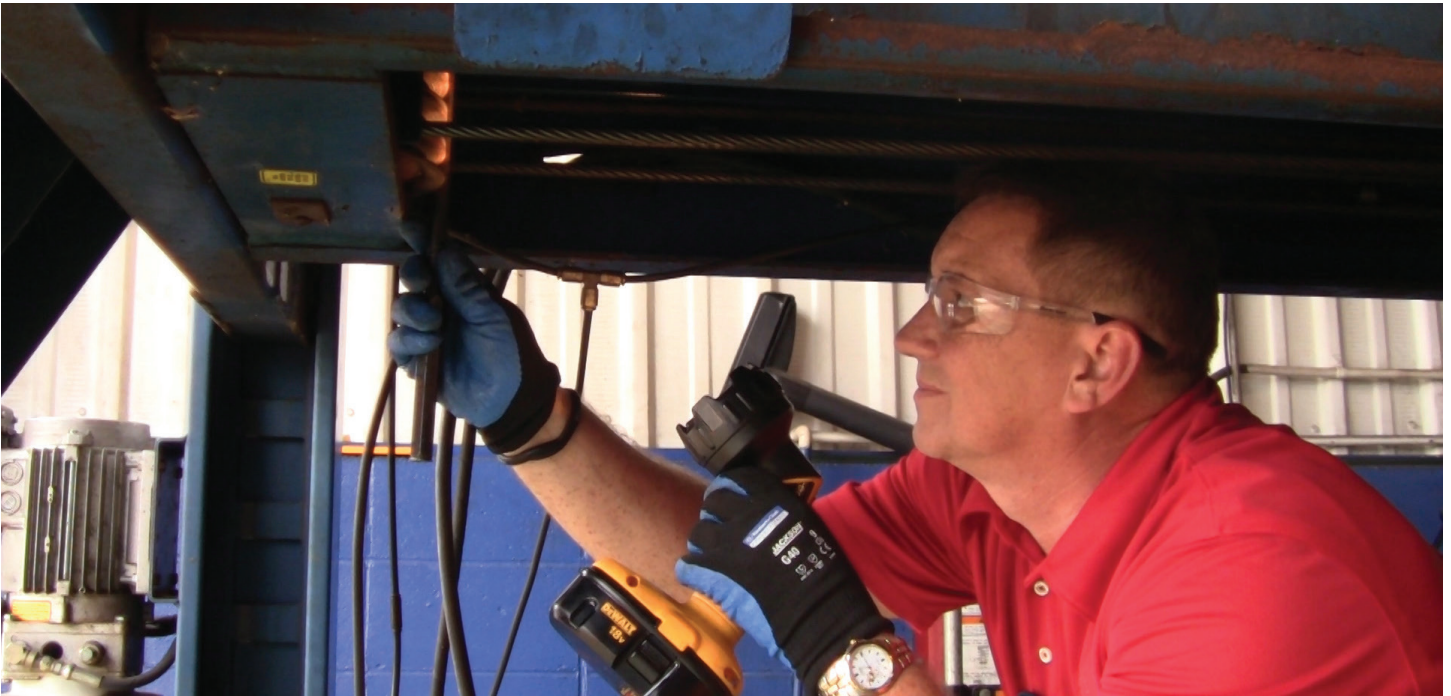
Each ALI Certified Lift Inspector is proven capable of conducting a comprehensive vehicle lift inspection using industry-created documentation. The three-part inspection process includes reviews of operator training and planned maintenance logs, and a mechanical analysis with 40 to 120 inspection points, depending on the lift type and accessories.

The ALI also offers Lifting It Right: On-line Edition, a full online lift safety training course hosted by Richard and Kyle Petty that covers lifting, lowering and maintenance for a variety of lift types. Because the course is online, dealerships can have their technicians take it individually at a convenient time and place. At the conclusion of the course, a certificate of completion is generated and stored online. It can also be printed and displayed or filed if desired, making it easy for the lift inspector, corporate safety officers and health and safety officials to verify that the training took place. Ask your ALI Certified Lift Inspector for details.